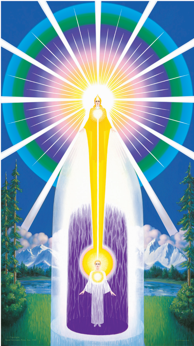
The Magic Presence